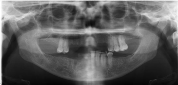
Figure 1 Preoperative panoramic radiograph of the patient elected for maxillary and mandibular All-on-Four™ implant rehabilitation.